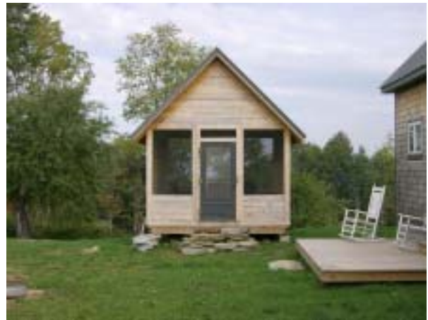
Gerald sawed the wood for this 12 ft x 16 ft Cedar screened building from the floor up.

I also have an assortment of air dried maple, shagbark hickory, butternut, and cedar for sale.