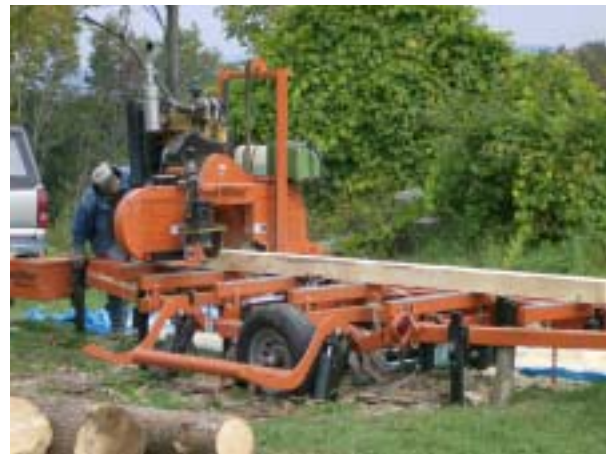
Wood-Mizer making a log into a timber.