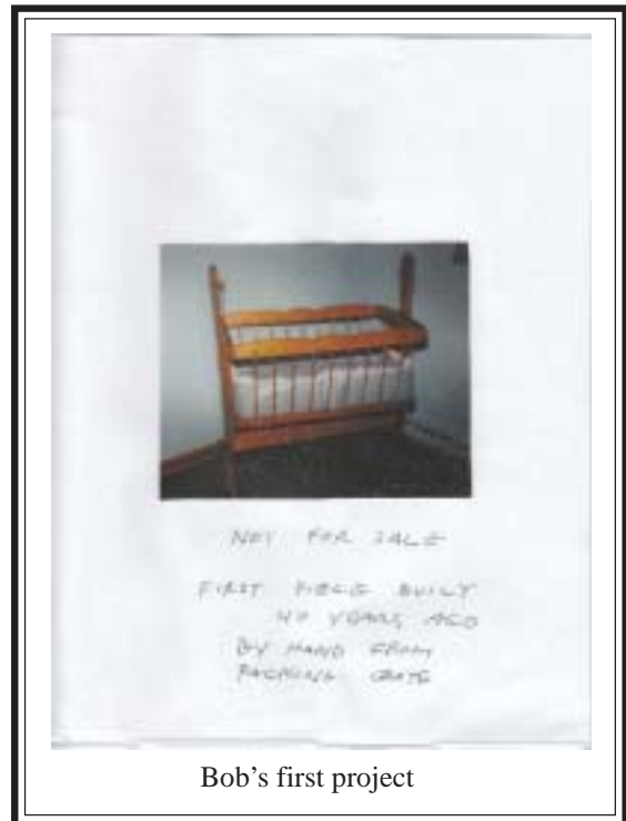
Bob's first project